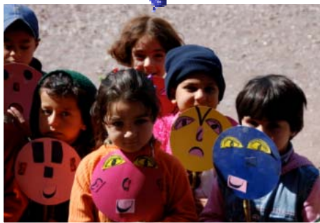
Kindergarten's art project