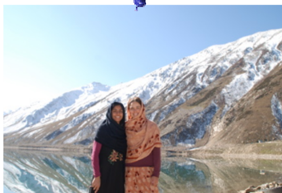
Our visit to Lake Saif-ul-Maluk