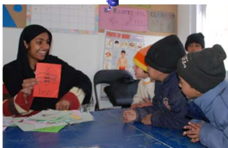
Kindergarten Learning new English vocabulary