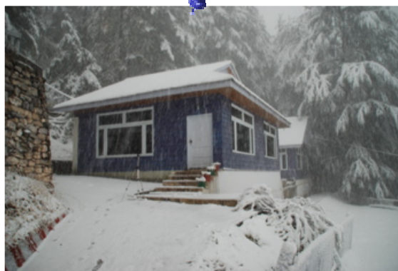
Our cabin in the snowfall, Shogran