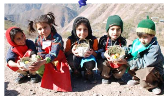
Grade 1's art project