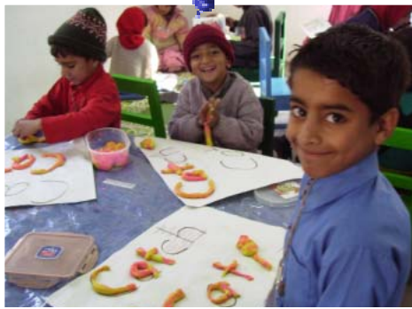
Grade 1 practising their letters