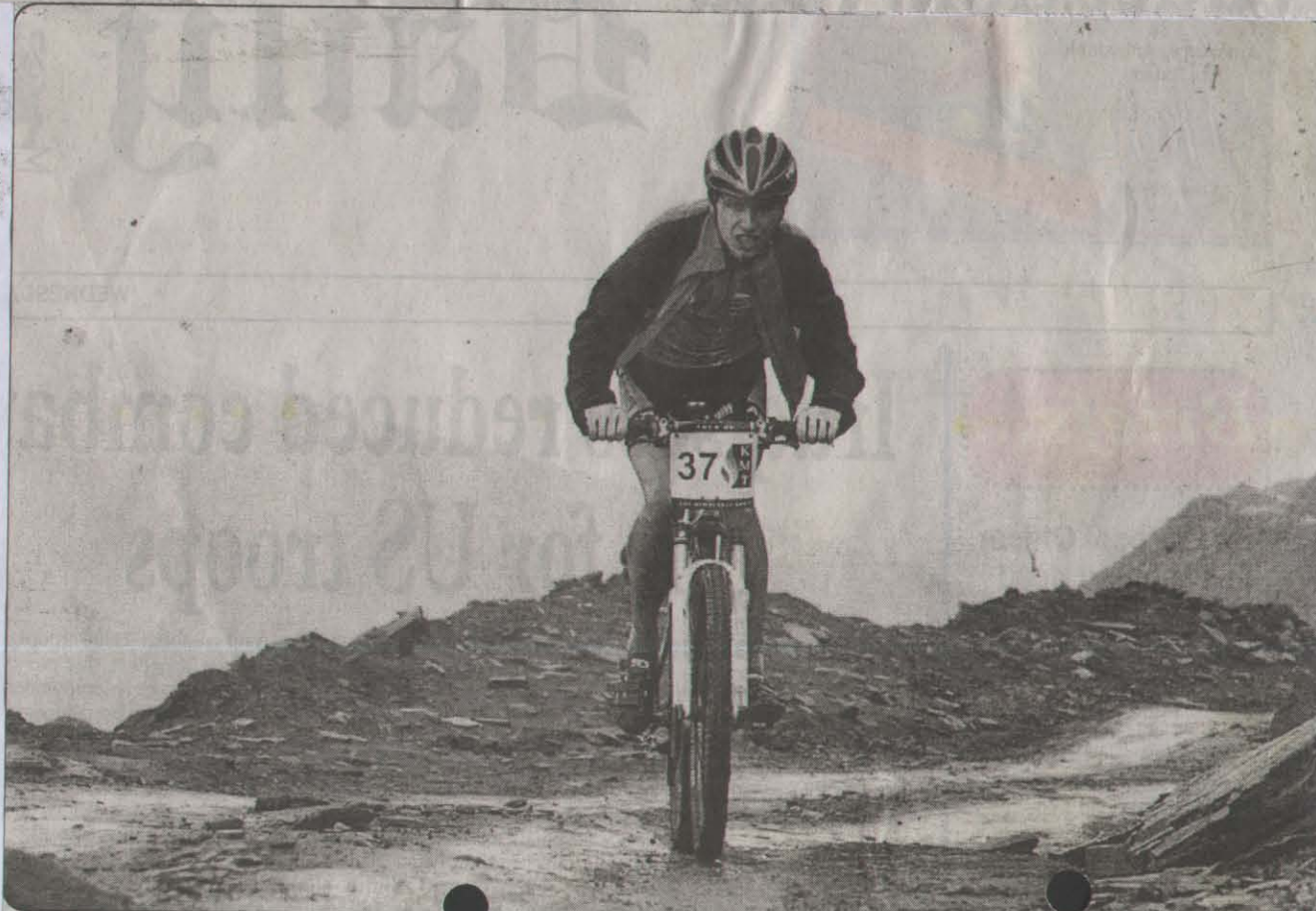
KAGHAN: A cyclist rides his bicycle at Abusar Top during the International Mountainbike Race & Mountainbike Tour organised by Kaghan Memorial Trust, here on Tuesday.