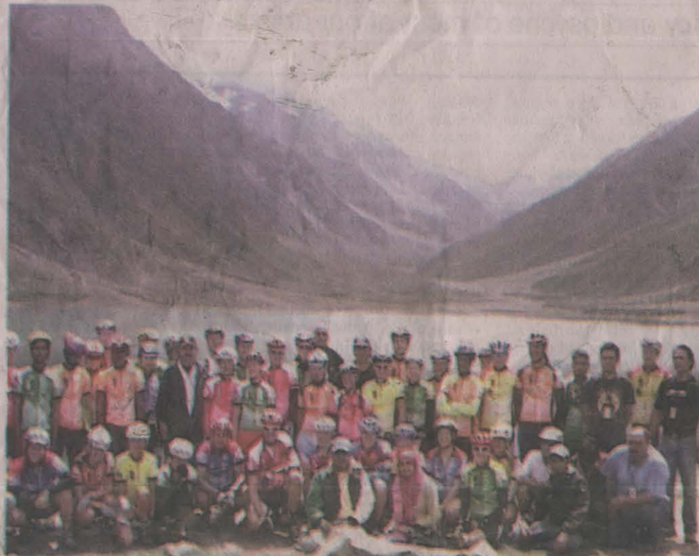
Participants at lake Saiful Muluk.

The third and final stage — whose starting point was Kaghan Memorial School Kawai (1450 metres) — was completed at Pai (2925 metres) with a distance of 20 kilometres. The bikers proceeded up the valley for one kilometre and then went to Shogran. They took to a road and then resumed climbing all the way up to Pai. They completed three laps of the 850 metres circuit in the meadow. Britain was declared first when it achieved the target in 6:03:08. Holland was declared second and Germany third.