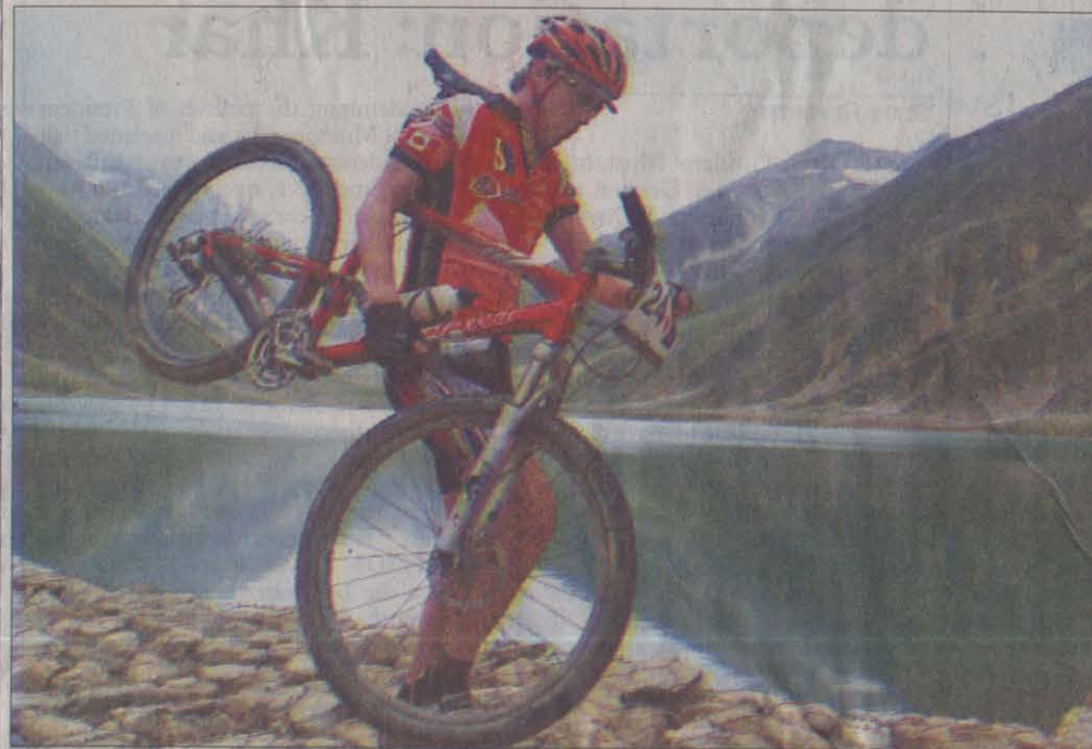
KAGHAN: A cyclist on his way during the International Mountain Bike Race organised by Kaghan Memorial Trust to help the earthquake affectees of the area.