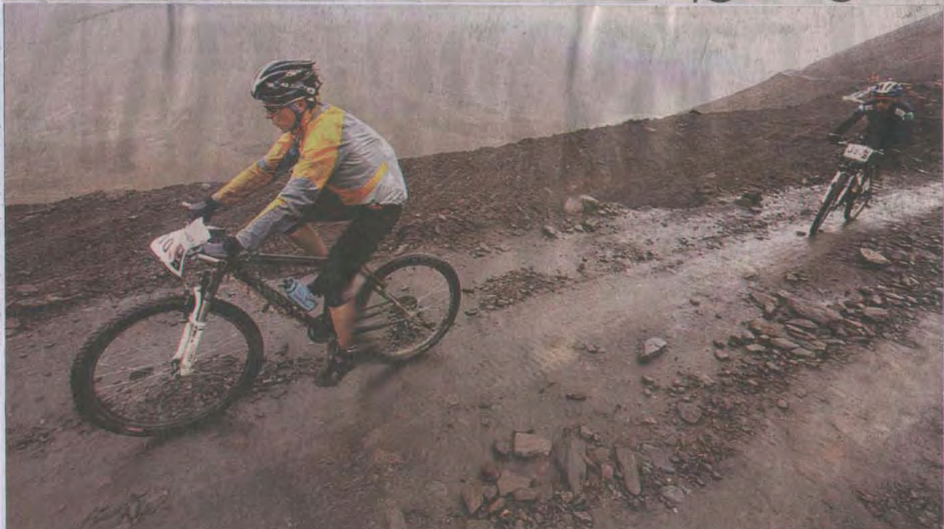
CYCLISTS cross a silt-strewn track during the international mountain bike race in the Kaghan Valley.